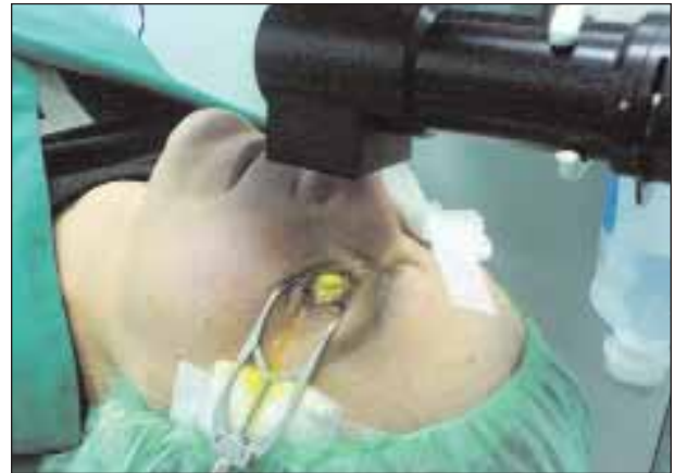
Figure 1. Treatment in progress; the cornea is soaked with riboflavin and irradiated by the UV lamp.

If the plan is to first stabilize the cornea with CXL and later apply limited T-CAT transepithelial PRK, one should wait at least 6 months in between procedures, as by this time the cornea will have completed the repopulation and deactivation of keratocytes. 12 It is essential to wait past this period, as it is likely that a cornea with still activated keratocytes during the first few months after CXL will react excessively to excimer laser injury, resulting in an exaggerated